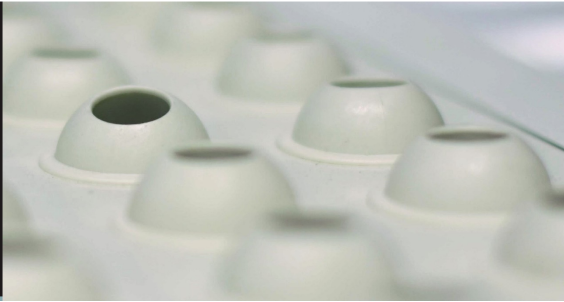
Table 2. Number and diameter of stubs of the diffuser plenum box, NWI, ød [mm]